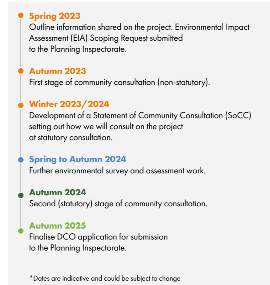
Figure 3: Project timeline