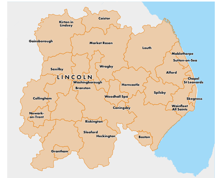
Figure 2: coverage area of Lincolnshire Echo

Media releases will be issued to outlets covering Lincolnshire and will include a mix of regional and local titles. The coverage area of the Lincolnshire Echo is shown below, which covers the largest area of the media titles which will be contacted. A list of the publications to which the Applicant will issue media releases can be found in section 10.