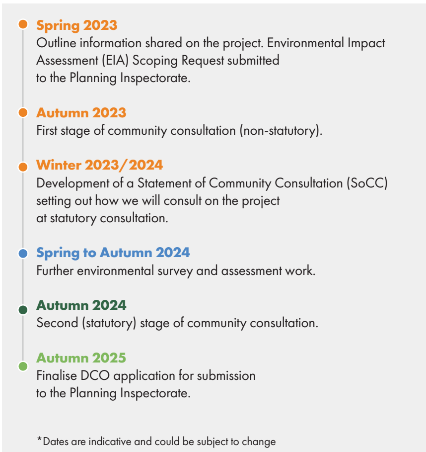
Figure 3: Project timeline