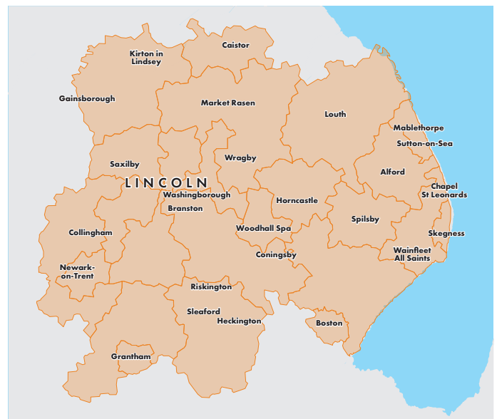
Figure 2: coverage area of Lincolnshire Echo

Media releases will be issued to outlets covering Lincolnshire and will include a mix of regional and local titles. The coverage area of the Lincolnshire Echo is shown below, which covers the largest area of the media titles which will be contacted. A list of the publications to which the Applicant will issue media releases can be found in section 10.