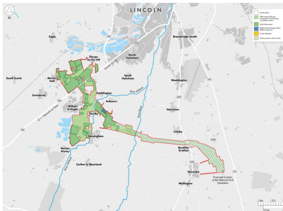
Figure 1-1 - Project Location Map